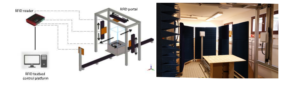
Figure 2. RFID testbed

This software platform was implemented onto small PCs, and was used to control the charge in a small and portable demonstration platform, to demonstrate how it is possible to interconnect this high level decision and communication software with low level components, such as a Battery Management System (BMS), and a battery charger. In 2016, in the context of the Greenfeed project our software has been demonstrated to control the charge of the electric vehicle during the final demonstration of the project. The integration work has been done in collaboration with VeDeCom<sup>1</sup>.