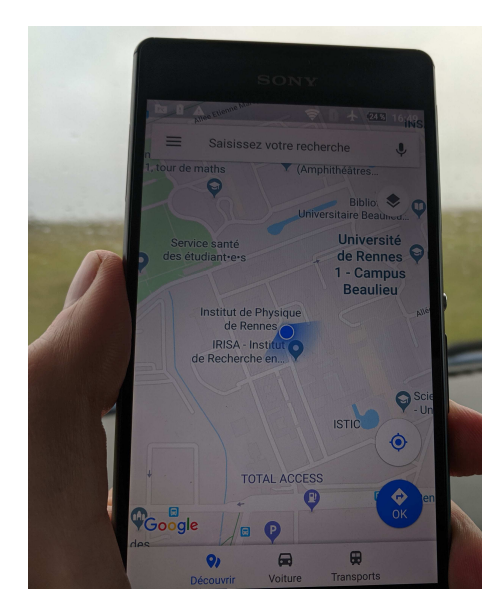
Figure 3. Google map deceived by faked Wi-Fi beacons replayed by an ESP-32

Unfortunately, location reporting methods implemented in existing services are weakly protected: it is often possible to lie in simple cases or to emit signals that deceive the more cautious systems. For example, we have experimented simple and successful replay attacks against Google Location using this approach, as shown on Figure 3.